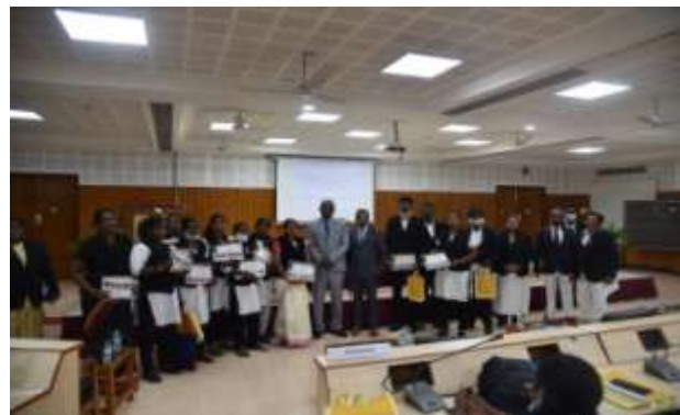
Certificates were distributed to all the participants.