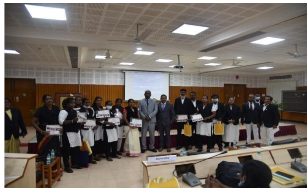
Certificates were distributed to all the participants.